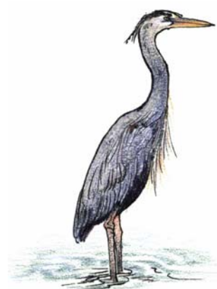
great blue heron

Mosquitoes have a very short life cycle and their eggs can remain dormant for more than four years, hatching when flooded with water. Therefore, even after a wetland has been drained, it may still hold enough water after a rain to breed mosquitoes.