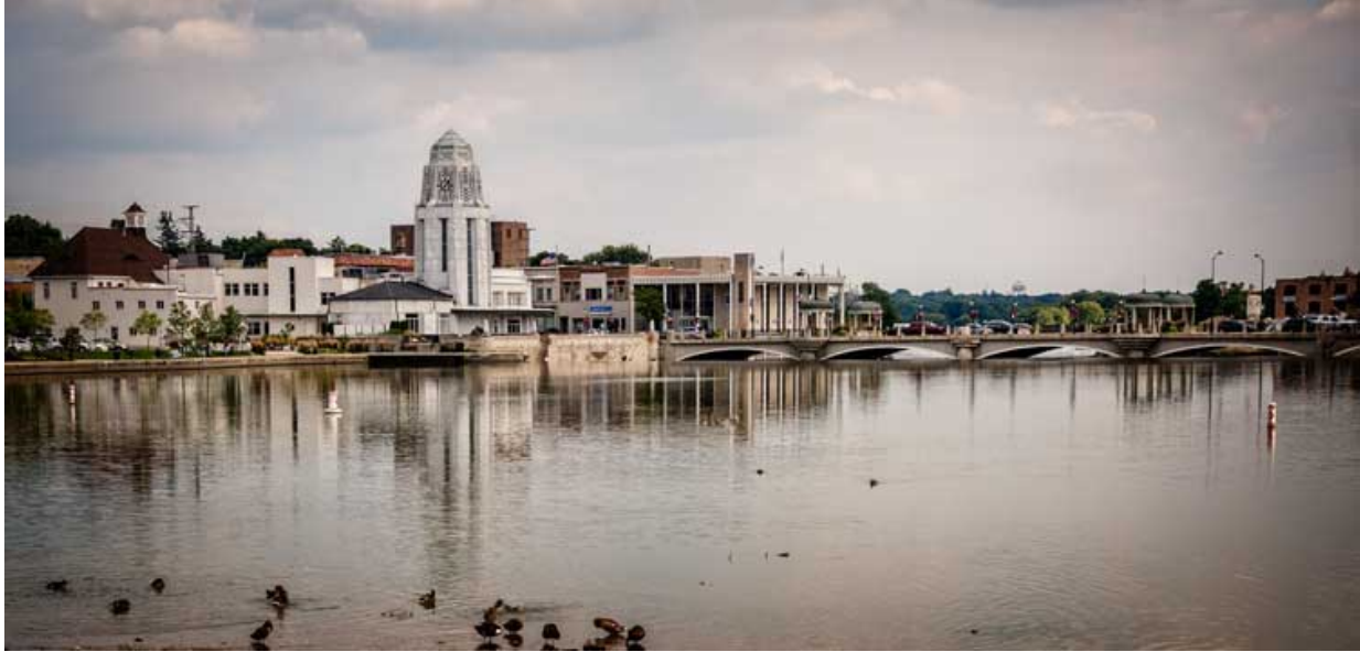
St. Charles, Fox River looking south