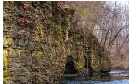
Photo of Mill Creek at Rt. 31 by Mooseheart