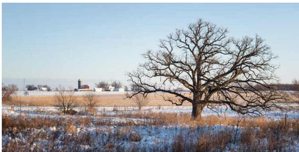
An Oak Tree in Northern DeKalb County - August, October, November, December

See his wonderful collection of photographs from around the state and country HERE