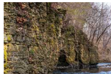
Photo of Mill Creek at Rt. 31 by Mooseheart

UPDATE: Outreach to communities and organizations with a stake in the Mill Creek watershed was wrapped up during August to identify opportunities for planning, policy, education, monitoring, and on-the-ground best management practices (BMPs) to help project and improve water and habitat quality. During the past month, CMAP staff met with the Friends of the Fox River, Lake Charlotte HOA, Fox River Study Group, Forest Preserve District of Kane County Environmental Education Department, and Kane County Planning Division. CMAP staff has mapped the site-specific BMPs submitted by stakeholders in preparation for the next step of estimating pollutant load reductions for applicable BMPs. Additionally, CMAP and Kane County staff developed "watershed-wide BMP scenarios" to account for common BMP types – including infiltration trenches, vegetated swales, rain gardens, permeable pavements, green roofs – that could potentially be implemented throughout the Mill Creek watershed but are not associated with a site-specific location at this time. Pollutant load reductions and planning level costs for both the site-specific and watershed-wide BMP scenarios will be included in the final plan which continues to be developed.