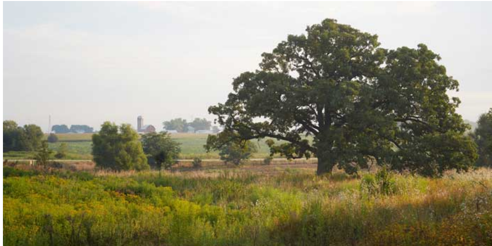
Winter is coming. . .