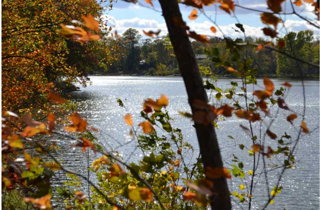
Fox River from Norris Woods, St. Charles Fall