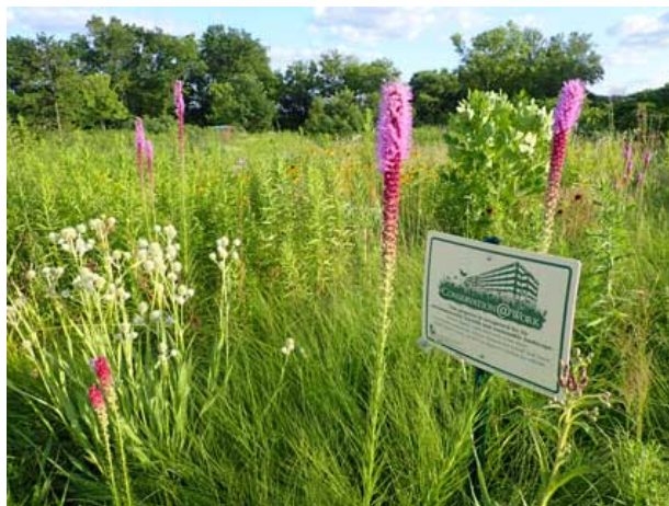
Photo: Conservation@Work at the St. Charles Park District's Hickory Knolls Discovery Center

The final draft of the Mill Creek Watershed-based Plan and an executive summary is available on FREP's Mill Creek webpage under the "Resources & Documents" section.