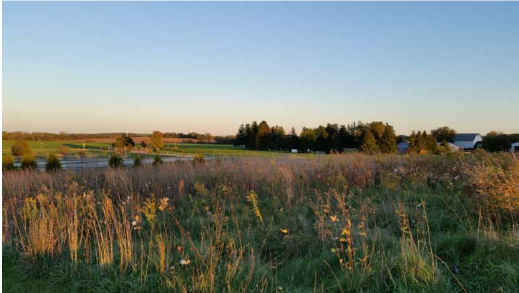
Looking east over Campton Prairie at Anderson Park, Campton Twp. Holly Hudson