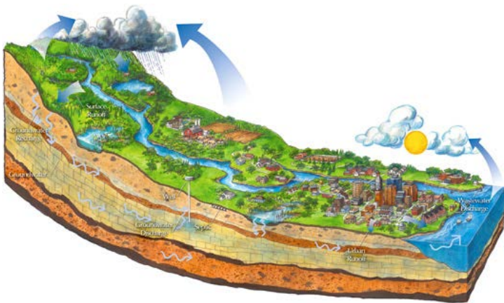
US EPA functions within a watershed

If it rains on you, you are in a watershed. You do not need to live adjacent to a body of water to be part of and to play an important role in the health of your watershed. A watershed is an area of land that drains into a common water body, such as a stream or lake. The watershed includes both the surface and groundwater within that area. The topography typically determines the area of the watershed and is often a reflection of the shallow groundwater gradient within the watershed. Our watershed is a sub-watershed to the Illinois River watershed, which is then part of the Mississippi River watershed. This means what starts in your backyard ends up in the Gulf of Mexico!