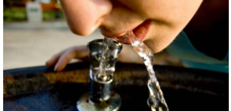
We need water for survival

The health of our watershed is critical to the well-being of the population within and downstream of the watershed, because how we treat the land impacts the quality of drinking water we extract from the Fox River or groundwater, as well as wildlife habitat and recreational resources. A healthy watershed supports healthy and sustainable communities. Water is fundamental to life. Here in the Fox Valley we rely on the Fox River and/or groundwater resources. Fertilizer, pesticide, salt, sediment and other impacts to tributary streams that feed the Fox River impact the quality of the Fox River as well as regional groundwater. Further, the health of wildlife habitat depends on clean surface and groundwater as does our enjoyment of recreation activities within this watershed.