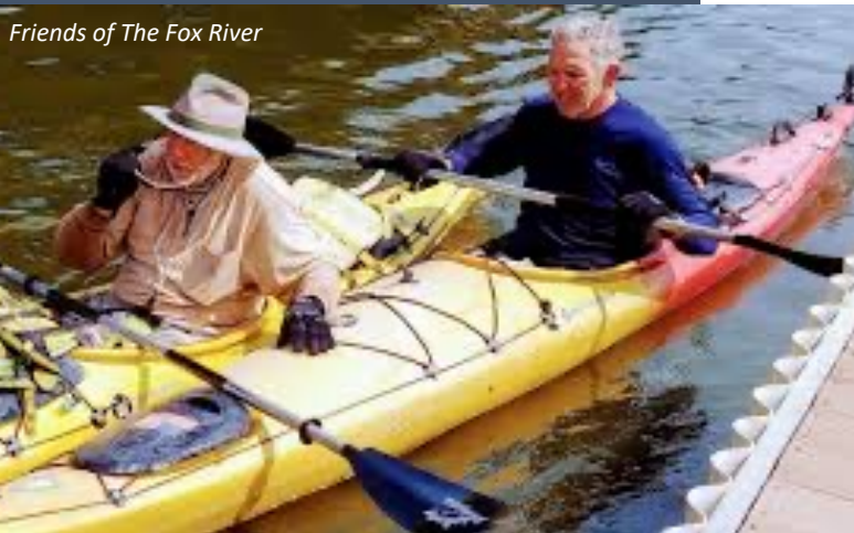
Friends of The Fox River

https://dnr.illinois.gov/grants/boataccessareadevelopmentprogram.html